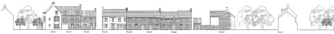
Elevation A - A' Street connecting the Pocket Park with the Pocket Place